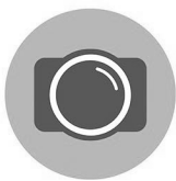
PHOTO GENIUS COURSES & WORKSHOPS